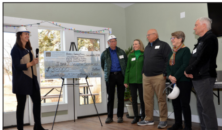
The three largest donors spoke at the groundbreaking about the project and why they support this program.

The Rotary Club of Greater Bend has committed $75,000, the largest gift toward the project to date.