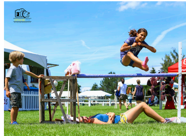
Kids practicing jumps of their own

The Oregon High Desert Classics returned to J Bar J Boys Ranch again this summer, marking the 30th year for this outstanding event.